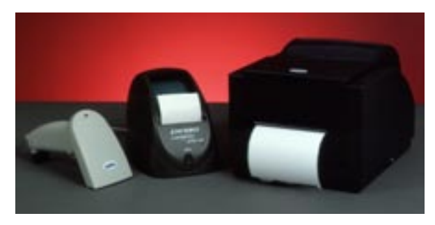
SuperII Peripherals: (from left) 500 Scanner, 300 Dymo Printer & 400 Direct Thermal Printer

Where ambient lighting conditions are poor, CCFL backlighting provides a bright, easy to read display from any angle. And thanks to minimal power consumption, it can provide hours of service even when operating off the scale's internal battery.